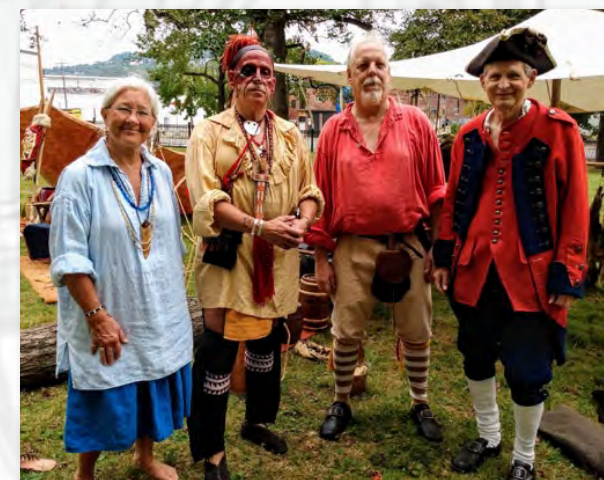
Native American, Pioneer and Colonial Reenactors

weaving and calligraphy. Because this was also a birthday celebration, children enjoyed free face painting and a "barnyard" petting zoo.