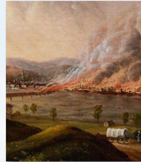
The Great Fire of Pittsburgh, 1845