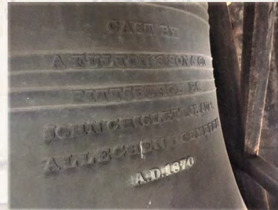
Allegheny's Fulton Bell