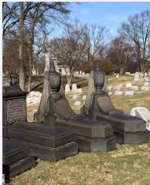
Fitzsimons Family Memorials

About ten above-ground grave-length carved and polished gray granite grave markers, with decorative inscriptions, long ones, are there, including Bible verses and testimonials, and are topped with urns draped with cloth so realistic you might mistake it for velvet or wool, rather than the granite that it is. Yes, the “design and build” of this Fitzsimons/Morrison had been a costly project.