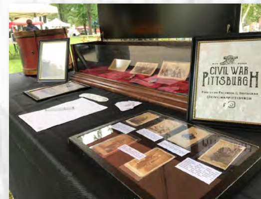
Civil War artifacts on display

A.C.H.A. is to preserve nearly two centuries of archival documents containing information and detail that is often not found elsewhere. All of our educational programming is aimed at celebrating our rich heritage and sharing the stories of those who have come before us with as wide an audience as possible. For this reason, we plan to make Heritage Fest an annual event, so that our story continues to be told and our heritage is preserved!